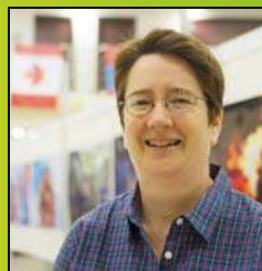
Gwynn Powell Program