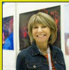
Carole Cheley Communications