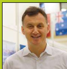
Fahrettin Gozet ICC Oversight