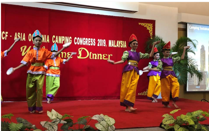
Talented children from Malaysia bring joy and culture to each day's general session.