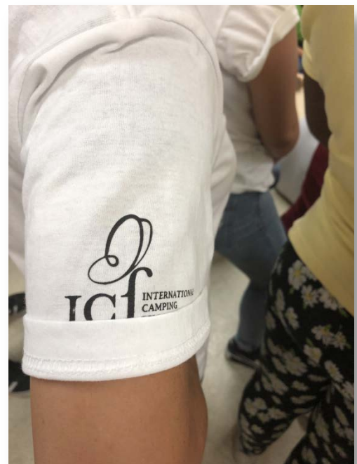
Camps and camp association celebrate membership in ICF as a global camping community