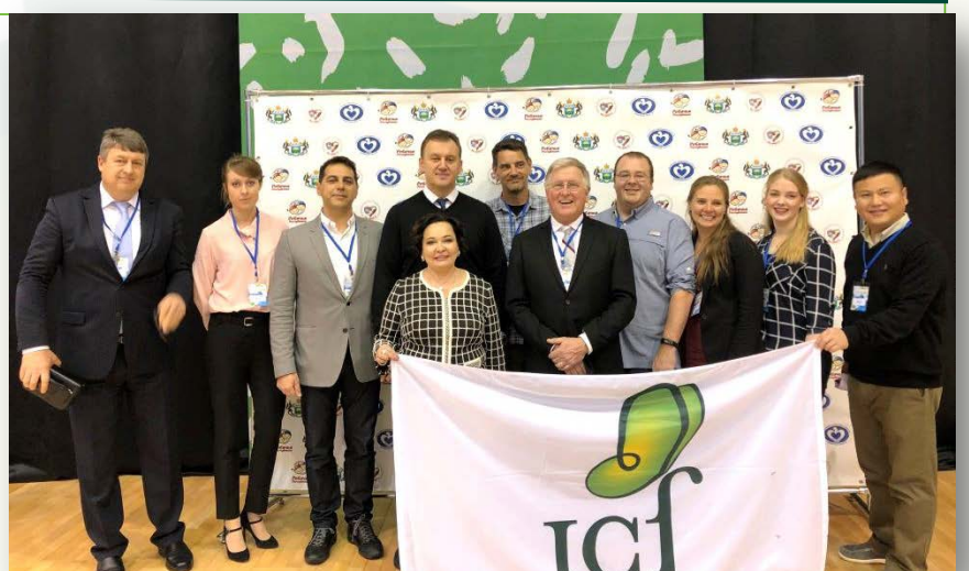
Guests from Bulgaria, Greece, Canada, Turkey, Australia, Finland and China attended the Tyumen Region Annual Conference in January