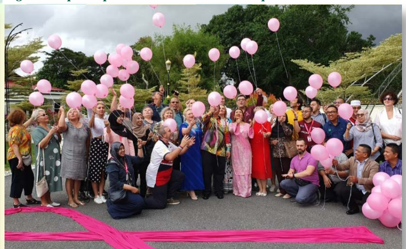
As part of the post-Congress tour, some members of the Russian delegation are received at the Crown Prince's palace in Perlis.