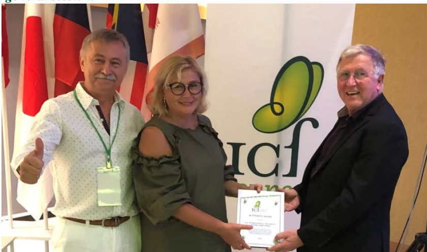
Russian Computeria Camp is presented with the ICF Butterfly Award recognizing their work to create International Festivals.