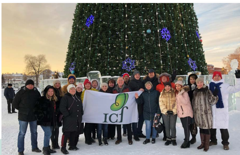
In January, the Tyumen Region Camp Association – ‘We Are Together’ hosted an international and interregional conference.