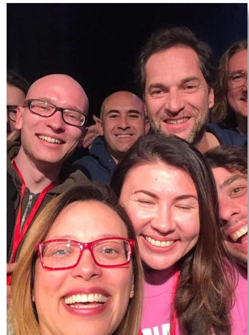
Friends from Russia and Colombia celebrate the International Camp Counsellor Course with a selfie.