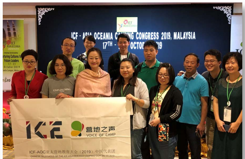
Institute for Camp Education & Voice of Camp from China join together to participate in ICF-AO 2019 and to promote ICC 2020.