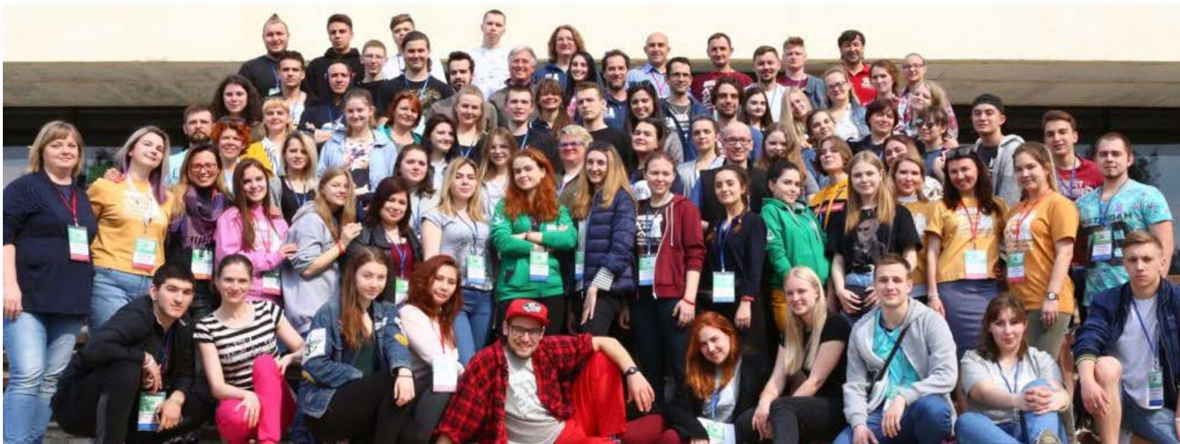
In April 2019, international presenters from Canada, Colombia and Venezuela contributed to the annual International Camp Counsellors Course (ICCC) in Camp Robin Hood south of Moscow, Russia