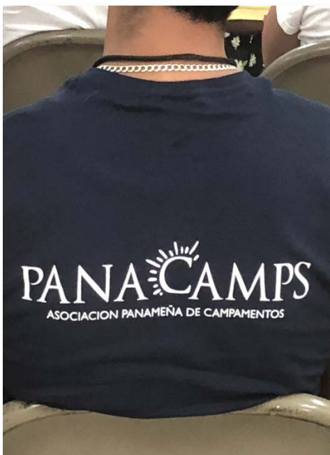
Camps and camp professionals in Panama now join together as an association for the growth of the community.