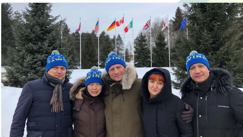
A delegation of camp professionals from Russia and Japan visits ICF Headquarters in Canada