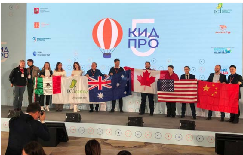
In November, Mosgortur in Russia hosted its annual conference called KIDPRO and made a special effort to include international leadership.