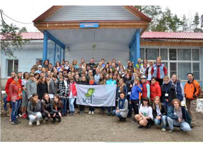
International Camp Counselors Course with Camp Industry and Computerya- Tver, Russia - April 2013