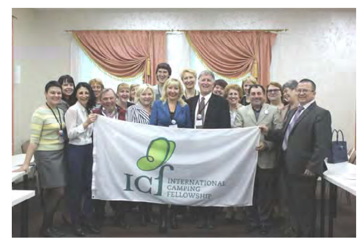
Camp Director Workshop for 'Heart of the Nation' Association - Samara, Russia - April 2013

ICF has made itself available to support local associations and regional projects. In April, ICF provided leadership at the camping association of Samara, Russia the International Camp Counselors Conference in Tver, Russia and 'World of Leadership' in Lanlate, Nigeria. ICF pre-Conference tours are a regular highlight for delegates at the American Camp Association in the USA. This year, the ICF Board presented leadership sessions at the Asia Oceania Camping Congress in Sydney, Australia.